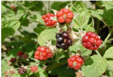
Images: Top left, leaf mottling on red raspberry infected with RLMV and RpLV, top right, crumbly fruit in 'Meeker' red raspberry, lower left, crumbly fruit in 'Marion' blackberry infected with RBDV and Blackberry calico.