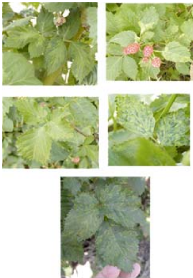
Figure 1. Symptoms normally associated with Blackberry yellow vein disease including vein banding and leaf mottling.

the disease it was not unusual that a blackberry field would be productive for 20 or more years whereas today 5-7 year rotations are the norm.