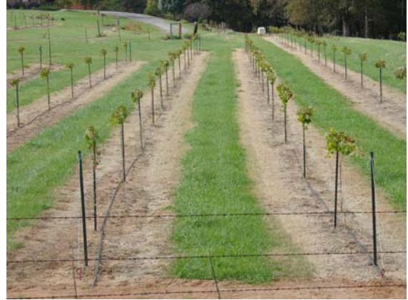
Chateau + Rely followed by Rely in August

If you are interested in learning more about preemergence herbicide options and suggested herbicide programs using preemergence herbicides visit www.smallfruits.org and click on the IPM/Production guide icon. If you have further questions contact me via email at wayne_mitchem@ncsu.edu .