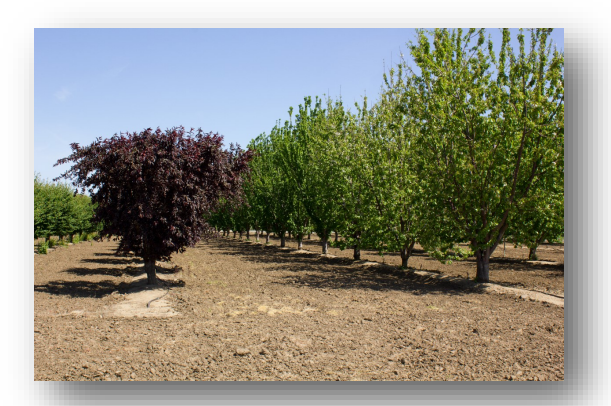
The orchards at FPS, University of California, Davis, are maintained as an elite source of propagation materials of commercially important Prunus scion and rootstock cultivars as part of the California Fruit and Nut Tree Certification Program.