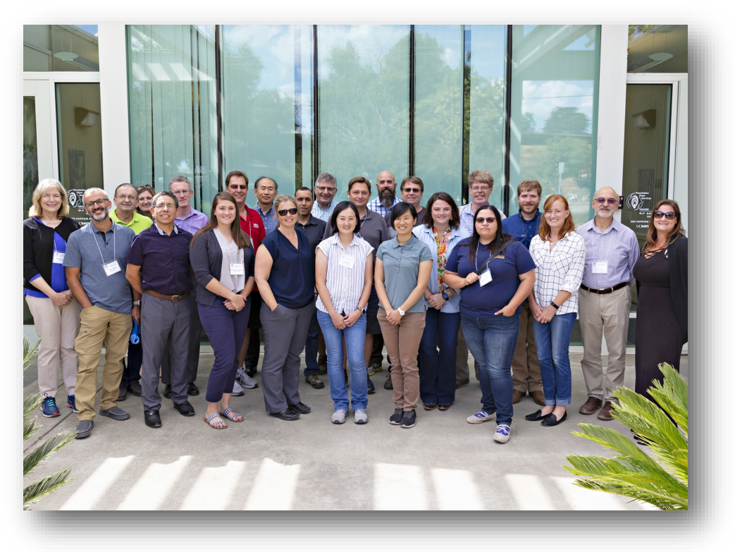
NCPN Fruit Trees Tier 2 and other stakeholders met at FPS in September 2019

Following the 2019 NCPN Fruit Tree Tier-2 annual meeting, a working group of NCPN center staff, state and federal regulators, and industry members was established to determine ways to modernize and streamline the fruit tree germplasm importation process. Over the past year we have met repeatedly to collaborate on updating pathogen lists, identifying which viruses are already present and widespread in the country, and determining the most effective diagnostic methods for specific pathogens. The outputs from this group will be used in guiding future regulatory decision making, producing a modern, science-based system to import fruit tree germplasm.