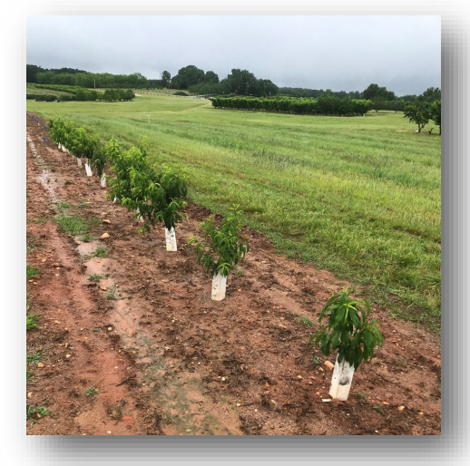
First-year stunted peach trees infected with PNSRSV, June 2020

In the Southeast the most problematic and common viruses are Prunus necrotic ringspot virus and prune dwarf virus. These two viruses are pollen-borne and are consistently found in orchards throughout the southeast. Symptomatology is highly variable and therefore it is difficult to diagnose trees based on symptoms alone. Some symptoms of PNRSV infection may include shock symptoms of stunting and foliar shot holes in the first year. In later years PNRSV infected trees might appear symptomless but produce smaller fruit with delayed ripening and yield losses up to 70% (Figure 1). PDV also shows varied symptoms that can include stunting, shortened internodes, and smaller fruits. Simultaneous infection with both viruses causes a synergistic (greater than additive) effect on the tree, known as Peach Stunt Disease. The Southeastern Budwood Program virus testing annually detects one or both of these viruses in 5-10% of trees that are tested in SC and GA, indicating persistent sources of inoculum. We recently detected PNRSV in wild cherry trees ( Prunus serotina ) near some commercial orchards in South Carolina and surrounding Clemson's Musser Fruit Research Center. Efforts to expand this survey and to understand tree to tree spread of these viruses are ongoing.